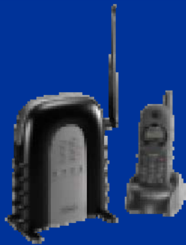
Single Line / Multi Handset