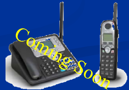
4-line Stand Alone PBX