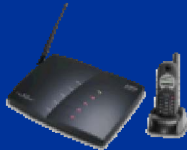
Multi-line / Multi Handset